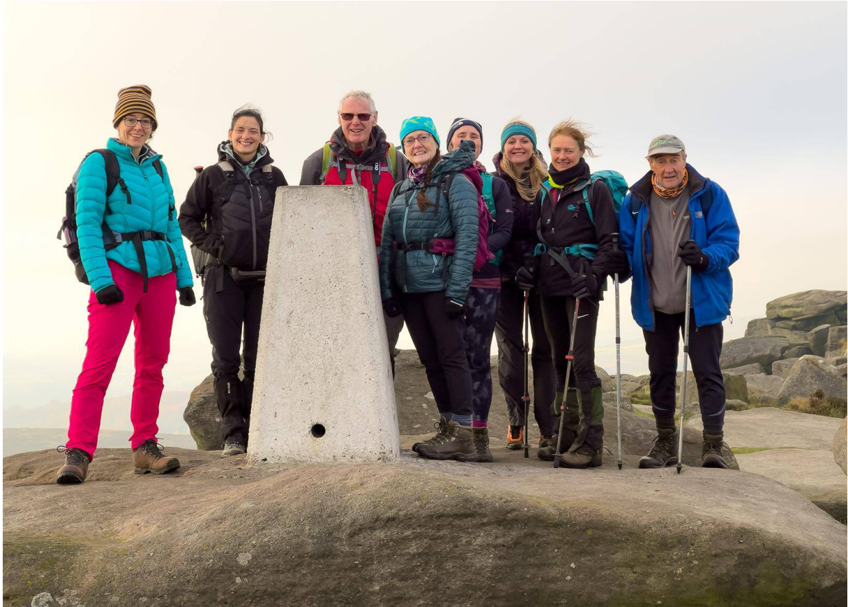
The team above Hathersage on the November Walk.